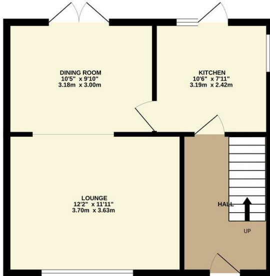
GROUND FLOOR 443 sq.ft. (41.1 sq.m.) approx.