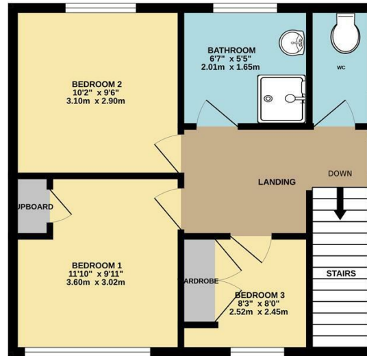
1ST FLOOR 443 sq.ft. (41.1 sq.m.) approx.